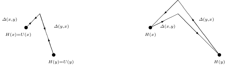
Fig. 1 Illustration of the result in Corollary 1. The picture on the left refers to the weak reversible case, whereas the picture on the right refers to the general dynamics with rare transitions.